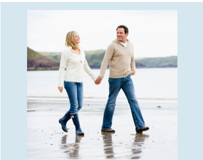
Open communication and teamwork are especially important when it comes to saving and investing for retirement.