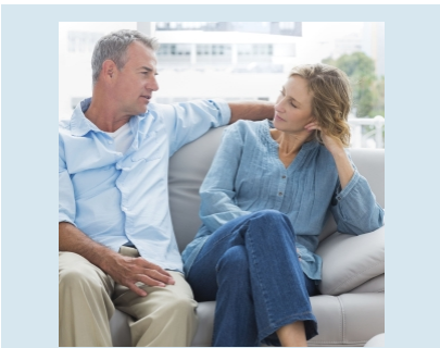
Market losses on the front end of your retirement could have an outsized effect on the income you might receive from your portfolio.